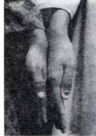
Guide touching the back of visually impaired person's hand