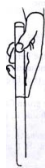
Crossing the road using a white cane