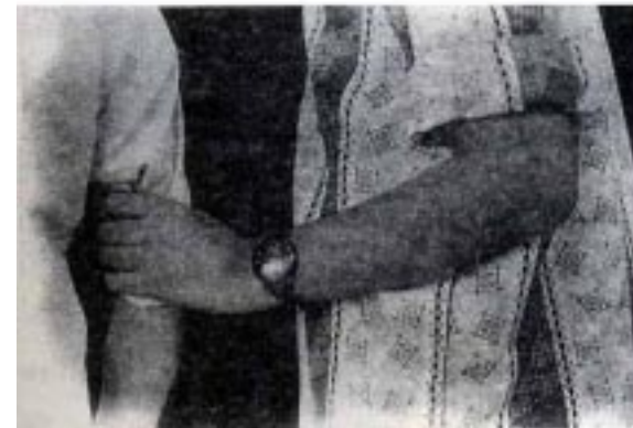
Holding the elbow